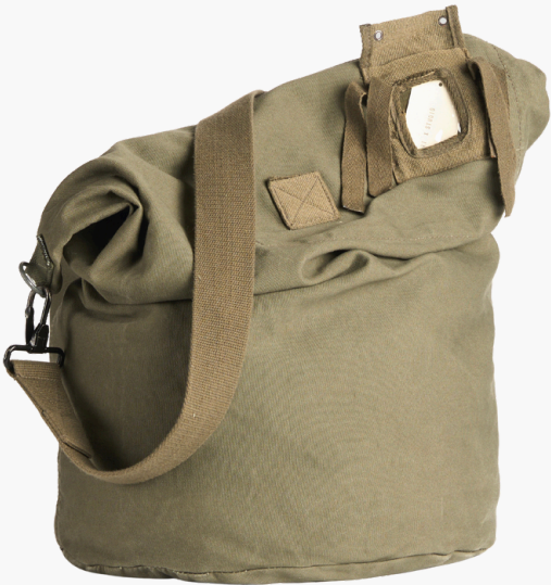
Custom Military Sea Bag Price: on request