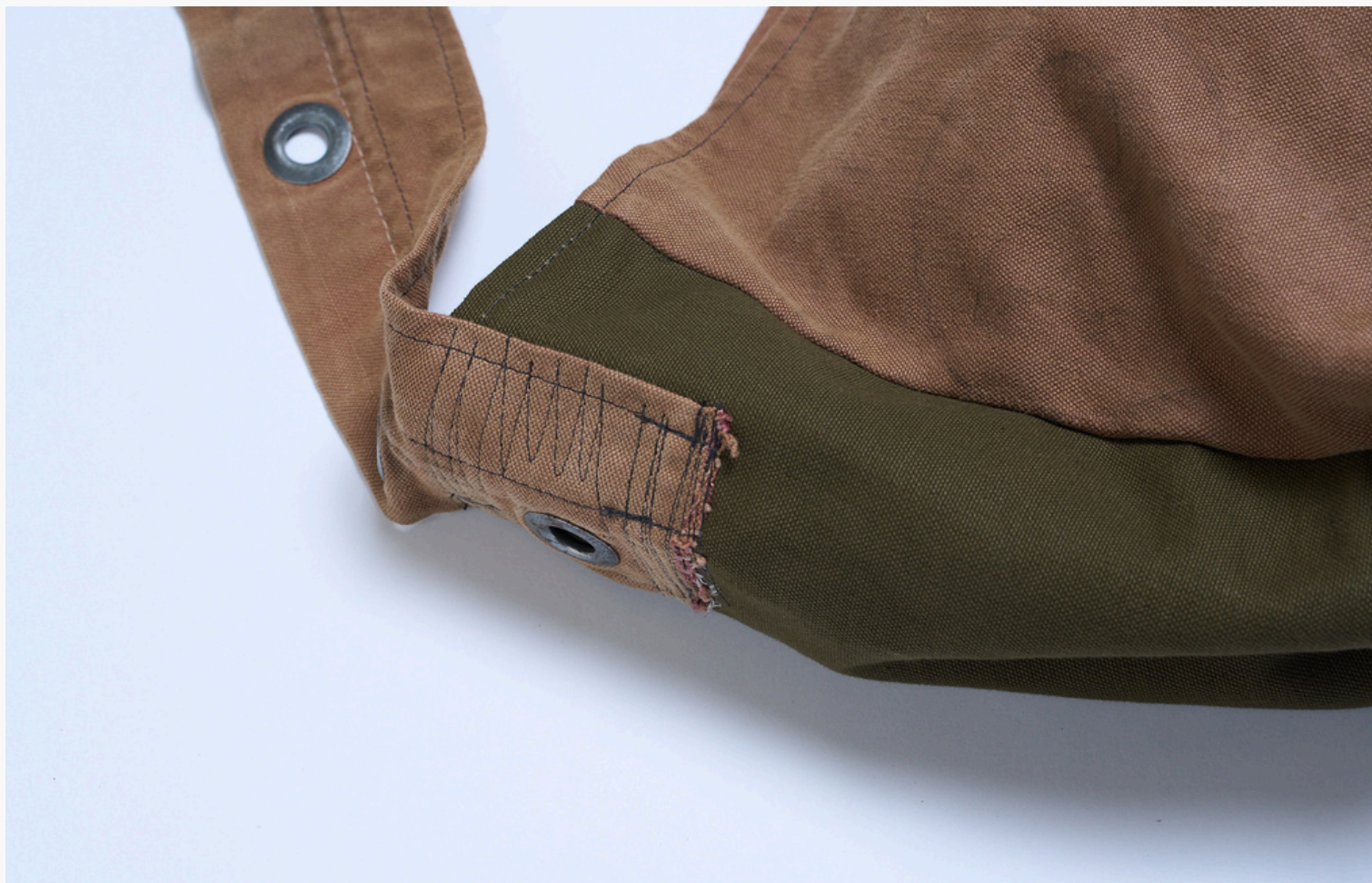
Style - The Newsboy