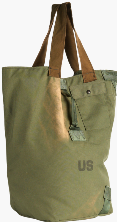
Custom Tote Price: on request