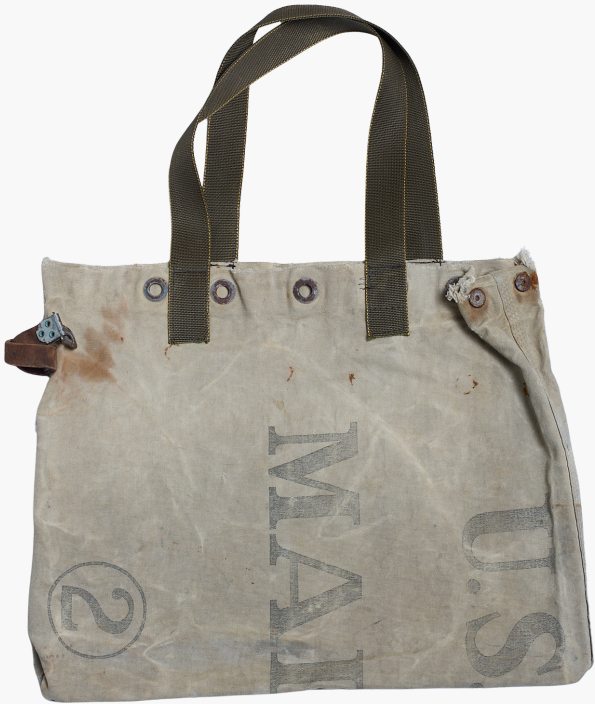
Custom Tote Price: on request