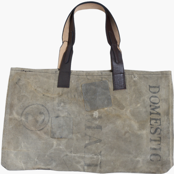
Custom Tote Price: on request