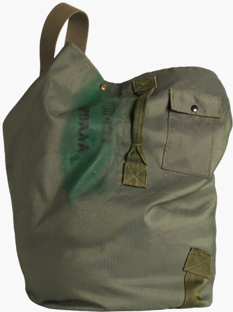
Custom Military Sea Bag Price: on request