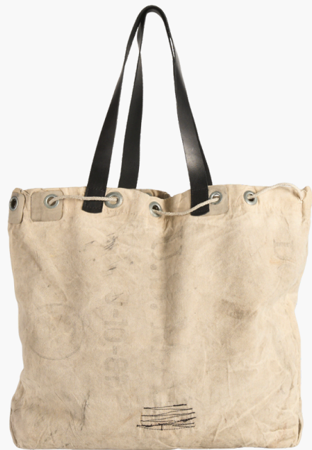
US Postal canvas for a Custom Tote Price: on request